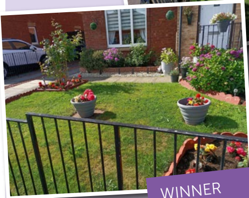
WINNER BACK & FRONT DOORS 26 LORNE DRIVE