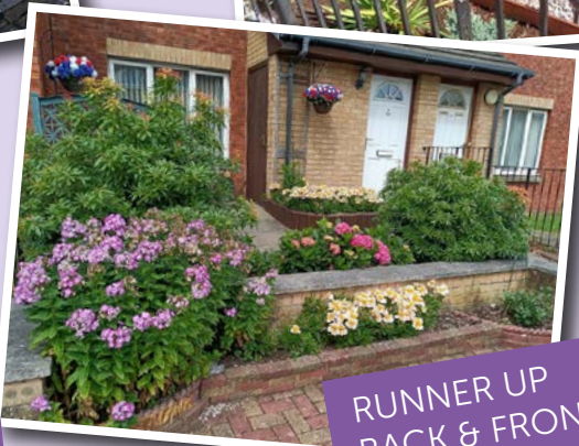
RUNNER UP BACK & FRONT DOORS 69 FIFE DRIVE